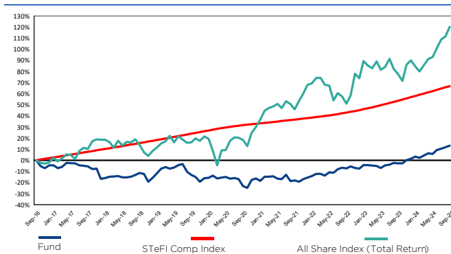
Fund Source: Apex Fund and Corporate Services SA as of September 2024 Index Source: Bloomberg as of September 2024