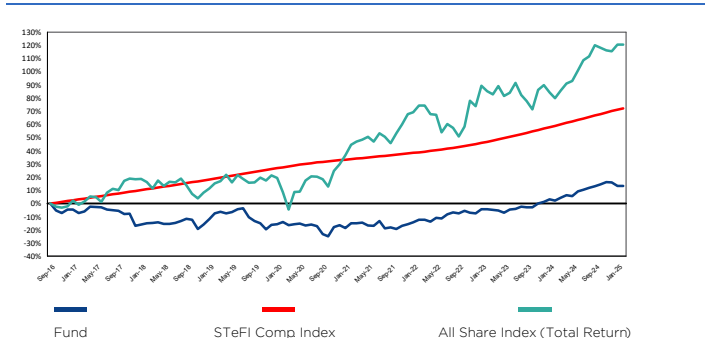
Fund Source: Apex Fund and Corporate Services SA as of February 2025 Index Source: Bloomberg as of February 2025